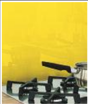
Zinc Yellow | 1018