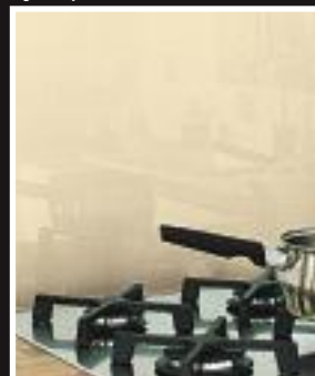
Light Ivory | 1015