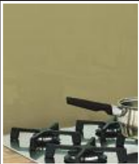
Olive | 1020