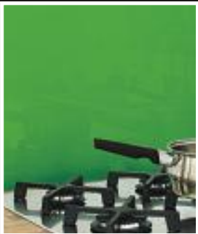
Yellow Green | 6018