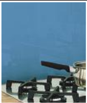
Pastel Blue | 5024