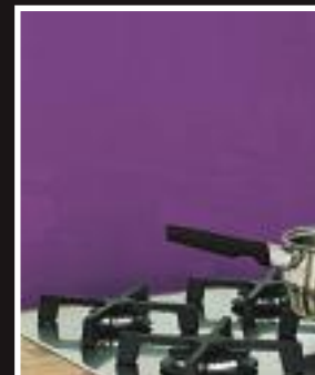
Red Lilac | 4001