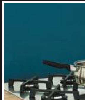
Azure Blue | 5009