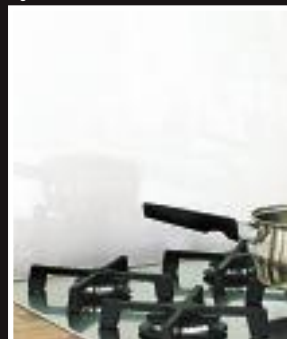
Signal White | 9003