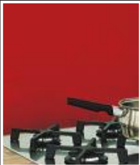
Traffic Red | 3020