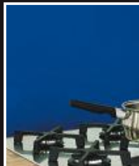
Signal Blue | 5005