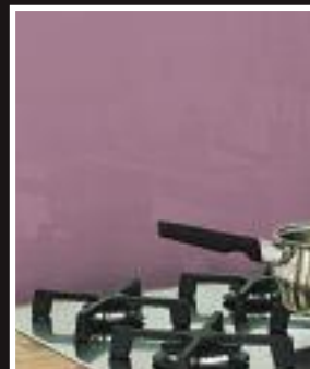
Pastel Violet | 4009