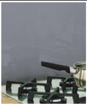
Silver Grey | 7001