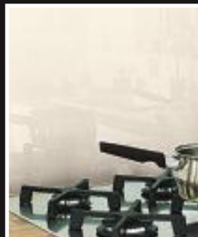
White | 9010