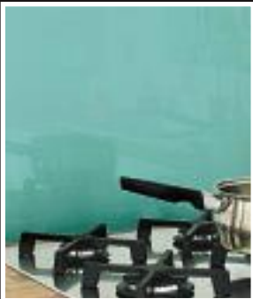
Pastel Turquoise | 6034