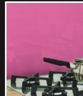
Heather Lilac | 4003