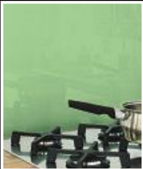
Pastel Green | 6019