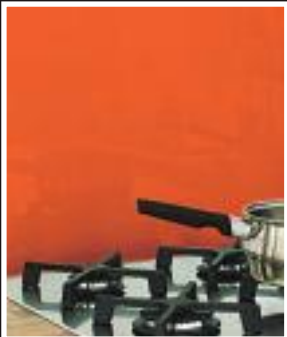
Bright Red Orange | 2008