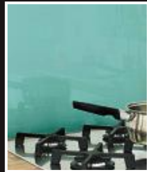
Pastel Turquoise | 6034