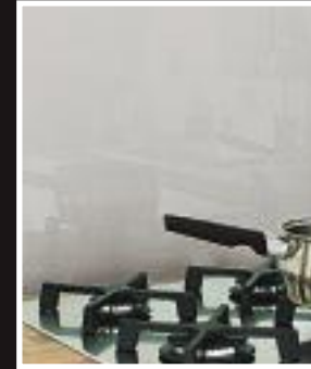
Light Grey | 7035