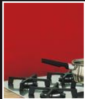
Traffic Red | 3020