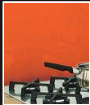
Bright Red Orange | 2008