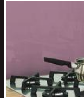
Pastel Violet | 4009