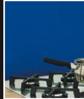
Signal Blue | 5005