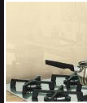
Light Ivory | 1015