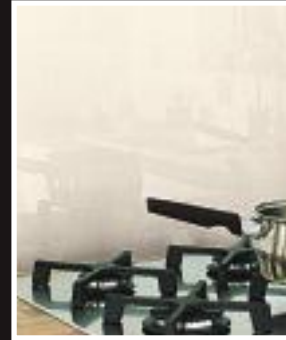
White | 9010