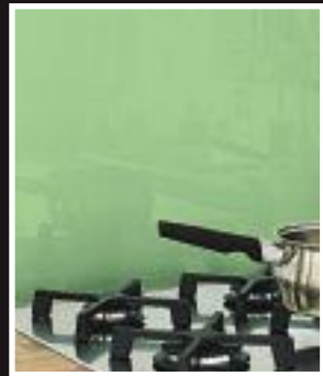
Pastel Green | 6019