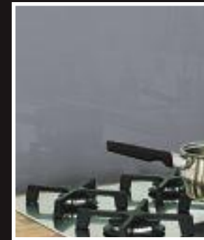
Silver Grey | 7001