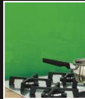
Yellow Green | 6018