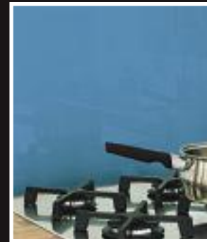
Pastel Blue | 5024