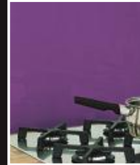
Red Lilac | 4001